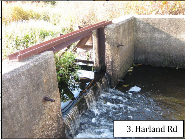
3. Harland Rd