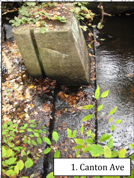
1. Canton Ave