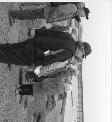
Nature walk participants gaze out over the Neponset River from the Quincy shore