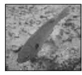
Streamflow levels are critical to healthy fish habitat.

Rain. Keep it coming! With all the talk of late about the drought afflicting the Northeast region of the United States, it would be hard for people not to stop and take notice when the infrequent raindrops finally make their way to people's rooftops, windshields and baseball caps. Unfortunately, several events of steady rain will not put our precipitation levels anywhere near where they should be for this time of year. And if precipitation levels are not where they should be, water levels in lakes, rivers, ponds, and streams are also apt to be far lower than normal. For the local environments that depend on adequate streamflow levels for the maintenance of healthy aquatic habitats, this summer might prove to be harder than most. But not by much. Drought or no drought, our aquatic environments are only going to get drier and become more stressed if our water use habits continue in the wasteful and inefficient manner to which we have become accustomed.